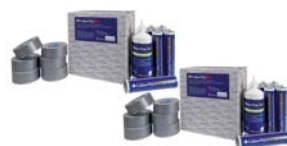
2x CaberfixPro Kits 50m 2