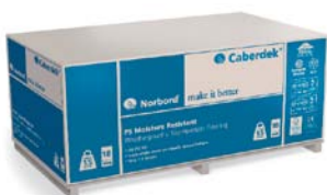
1x pack of Caberdek 100m 2